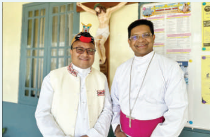
Catholic leaders of Shillong Archdiocese.